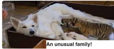
An unusual family!